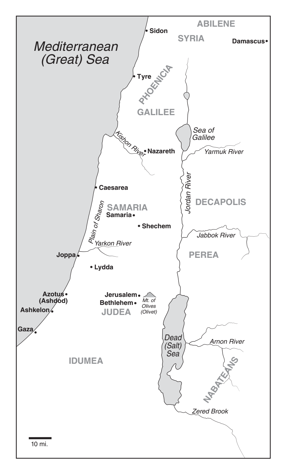
Acts Part 1 Map of Israel