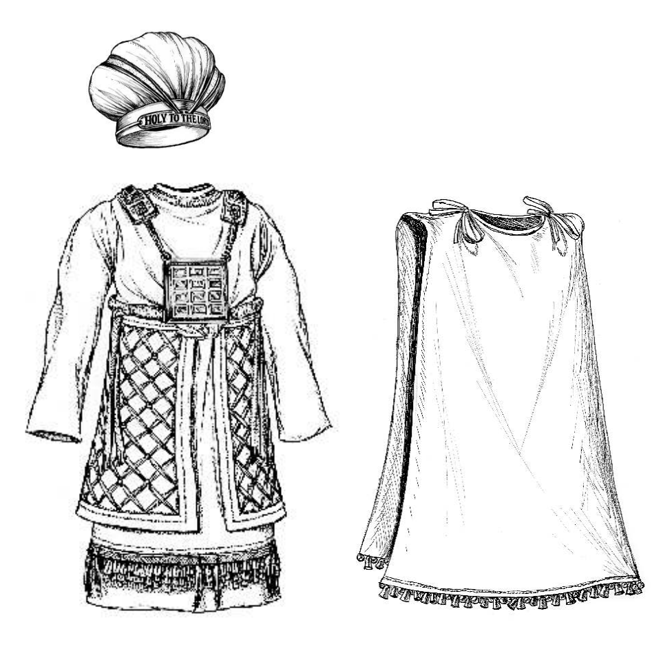
High Priests Garments